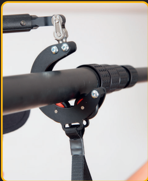
Boom Hook with rollers