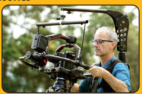
EasyTilt - Fits 25 & 30 mm