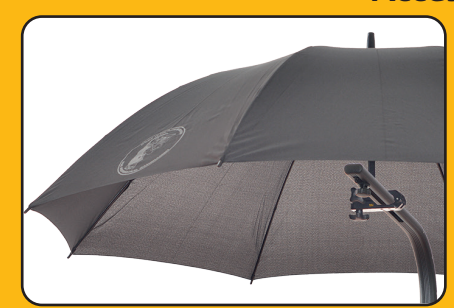
Umbrella with holder