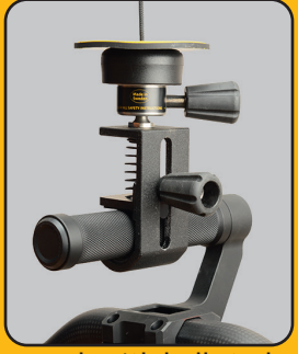
Hook with ball stud