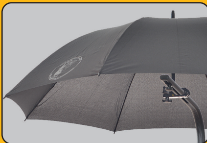
Umbrella w/ holder