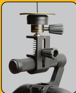
Hook w/ ball stud