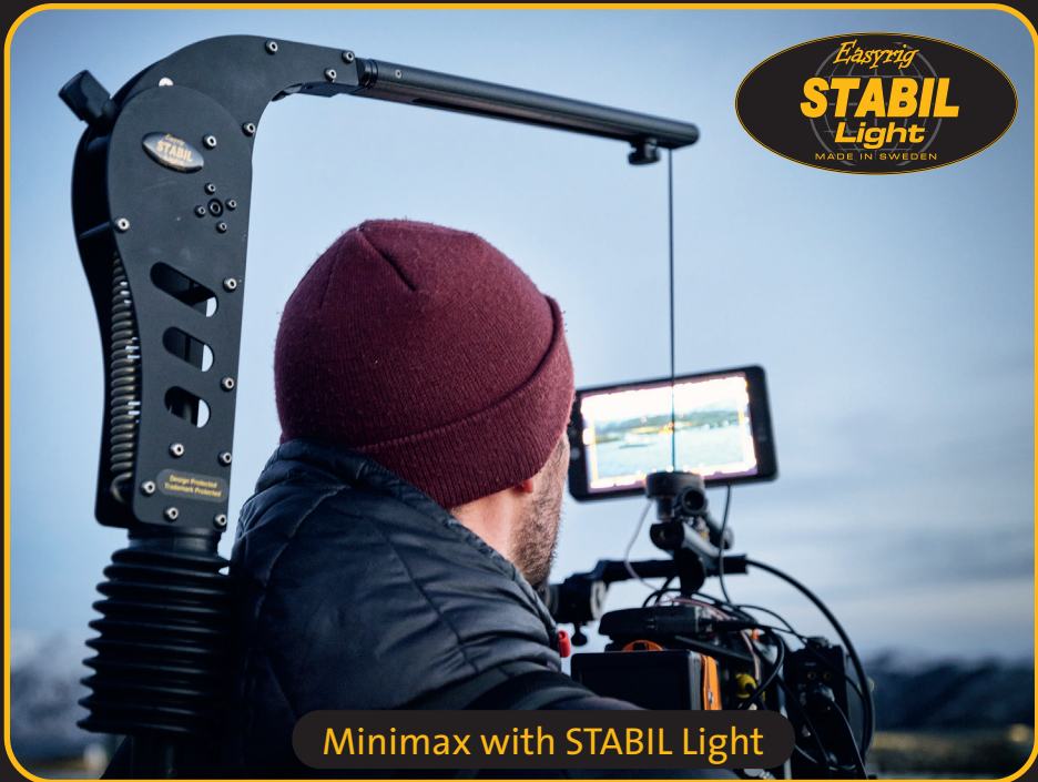
Minimax with STABIL Light

The STABIL Light was developed to support gimbals between 2-7kg (4.4-15.4 lbs). It will help stabilize hand held shots to a certain degree while protecting your back. This enables you to operate the gimbal and camera for much longer periods of time.